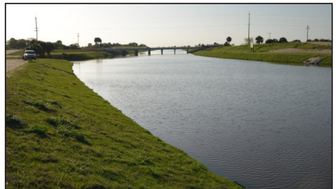
The C41a channel prepared for installation with the Xtreme Armor System (top), sod installation atop the PP5-Xtreme (middle), and the finished vegetated channel (bottom).