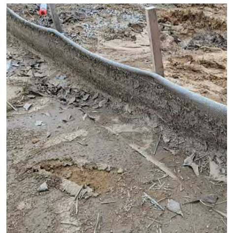
Shown Left to Right: Straw wattle deformation as degradation occurs, WattleFence in action under sediment-laden flows, WattleFence continued performance after multiple flow event.