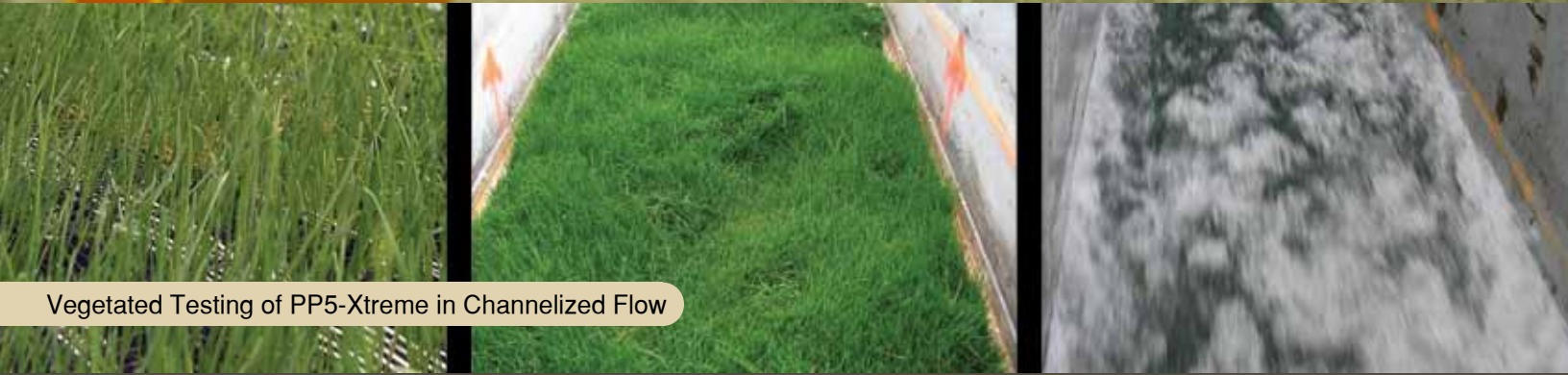
Vegetated Testing of PP5-Xtreme in Channelized Flow